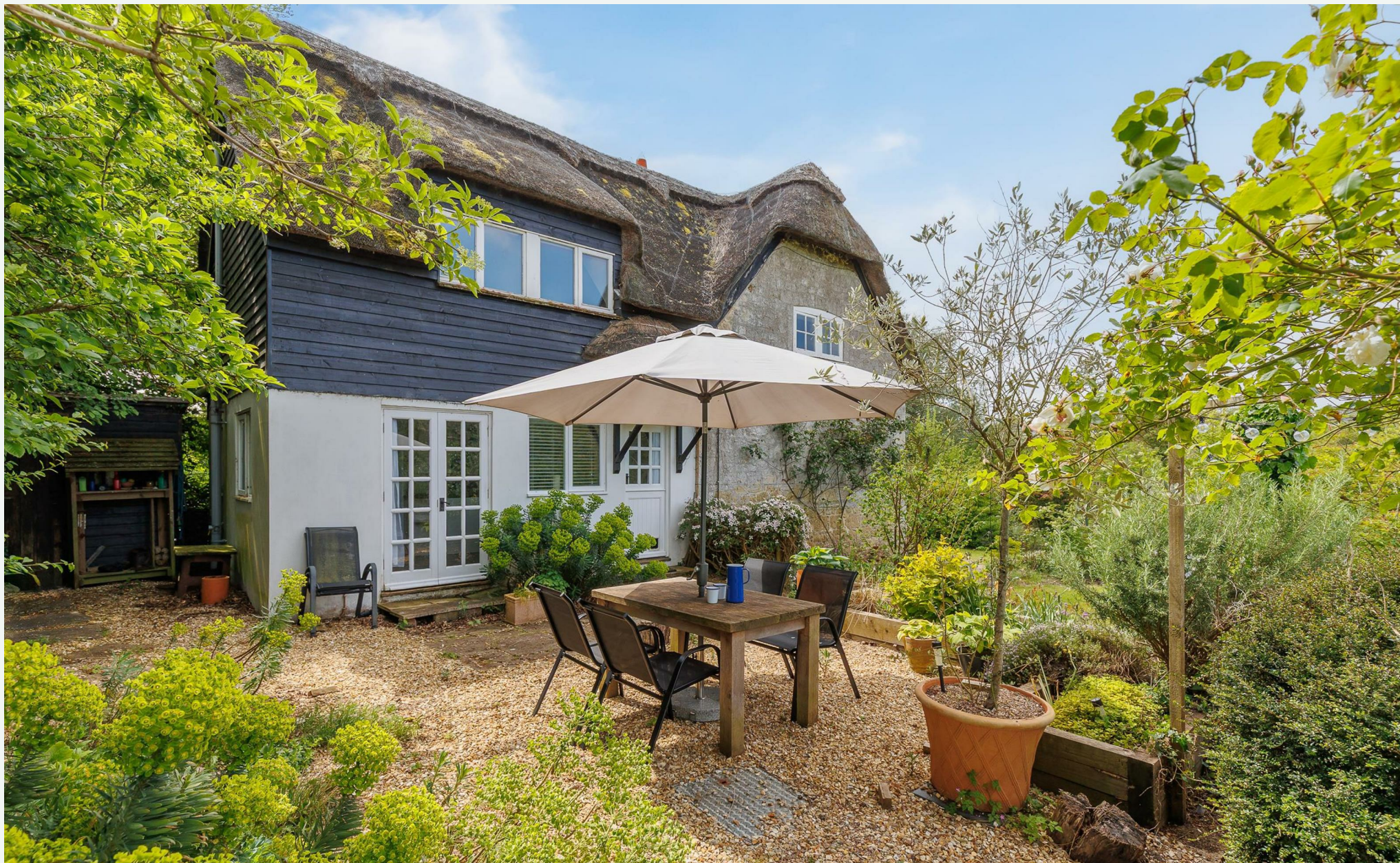
Millstream Cottage, Newbridge, Isle of Wight